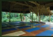
Yoga Shalla Ashram Munivara